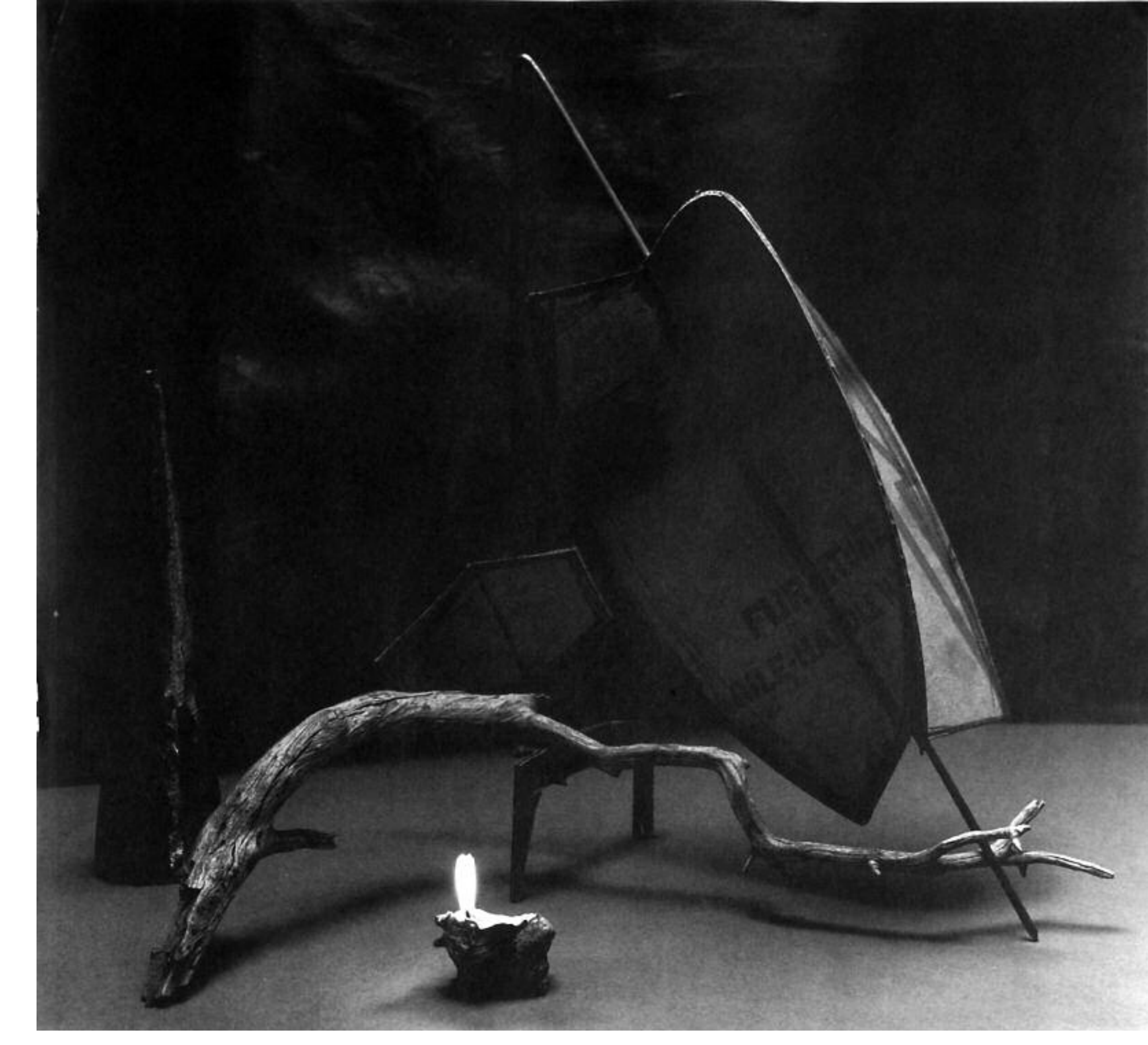
Henk Elenga. Prototype for light fixture, 1988.